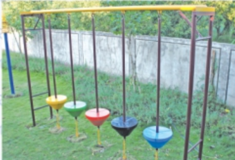
Disc Challenger - REX - 17