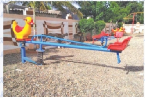
Arm Rider - REX - 10