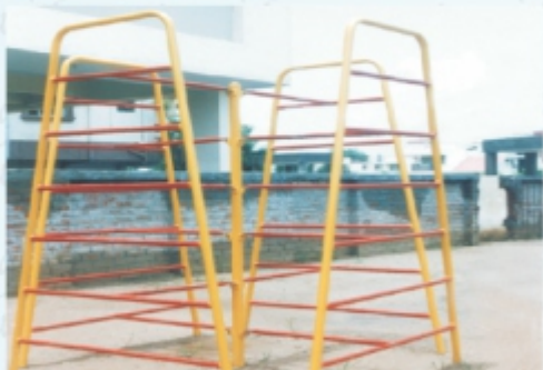
Criss Cross Climber - RCL-15