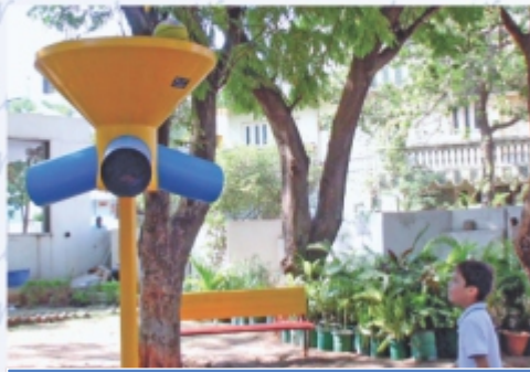
Funnel Ball - REX - 12