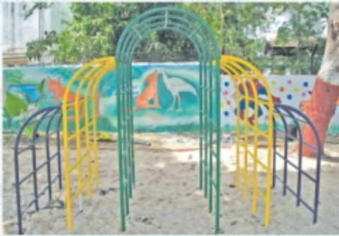
Rainbow Climber - RCL - 22