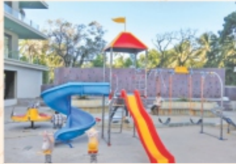
One Deck Multiplay System - RMPS - 17