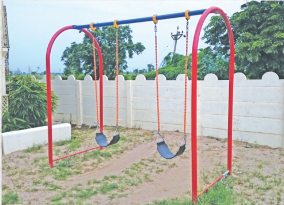
Arch Swing - RSW - 11