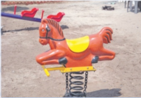
Spring Rider - REX - 07