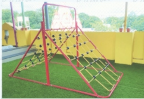
Small Net Climber RCL-13