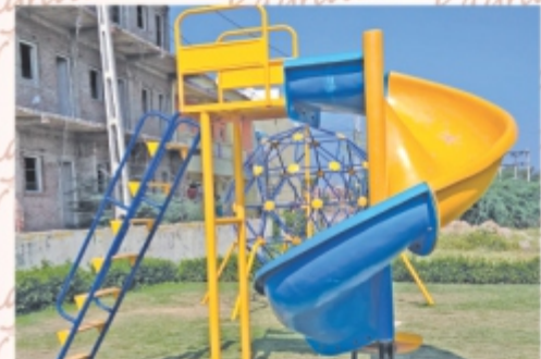
Spiral Slide Ht. 6'.0" - RSL - 09 & 09A