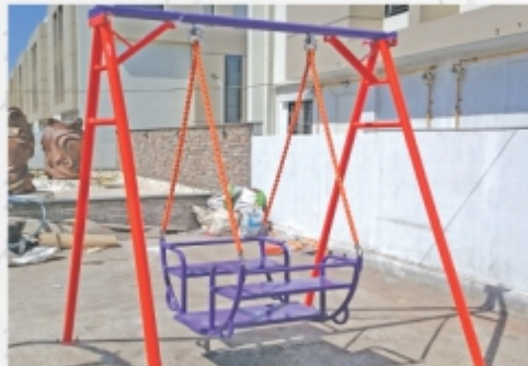
Kids Swing with Rocking Boat Single - RSW - 21