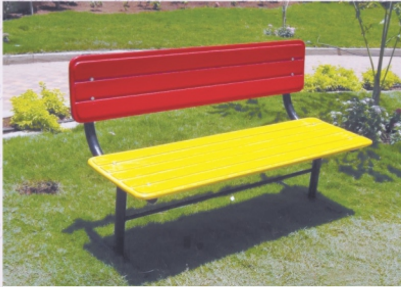
FRP Plank Garden Bench - RGR - 06