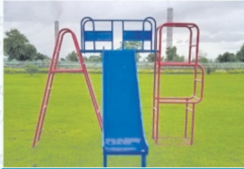
A to B Climber with Slide - RCL - 20