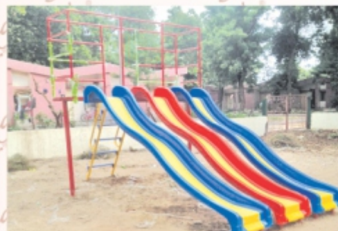
Tripple Wave Slide Ht. 5'-0" - RSL - 25