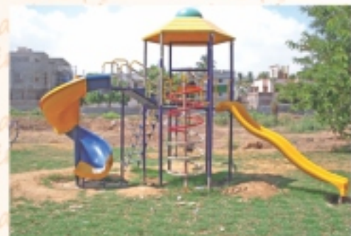
Hexagonal Multiplay System - RMPS - 06