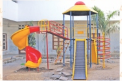
Hexagonal Deck Multiplay System - RMPS - 09