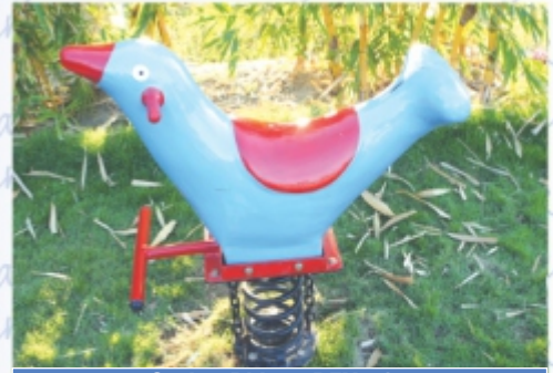
Spring Rider - REX - 07