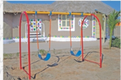
Arch Swing (2 Seats) HT. 6'-0" - RSW - 07