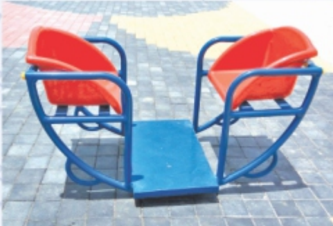
Rocking Boat 2 Seat - REX - 15