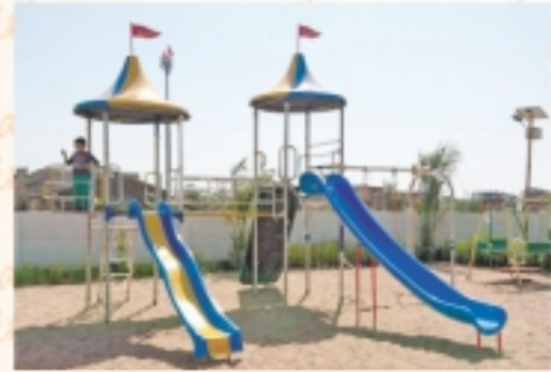
Two Deck Two Level Multiplay System - RMPS - 18