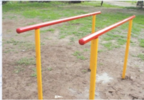
Double Bar - REX - 01