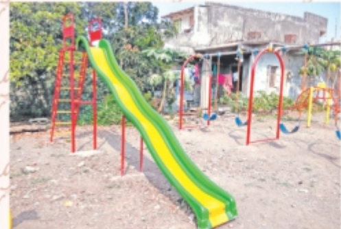
Wave Slide Ht. 7'-0" - RSL - 08