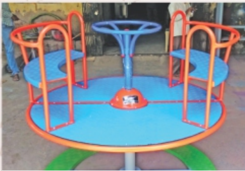
Self Mgr - RMG - 09