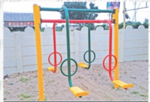
Zig Zag Swing - RSW-19