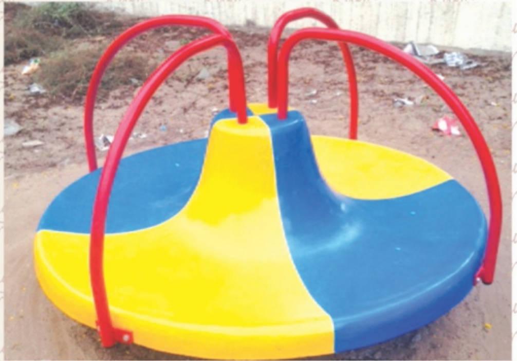
Twindler Go Round - RMG - 07