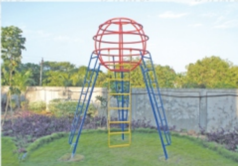
Satellite Climber - RCL - 03