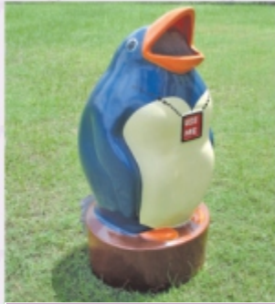
Penguin Dustbin - RGR - 04