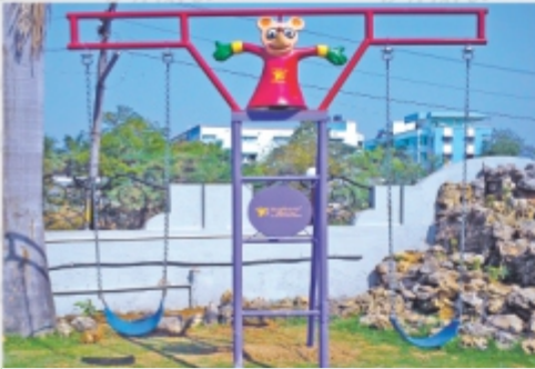
Jolly Swing - RSW - 08