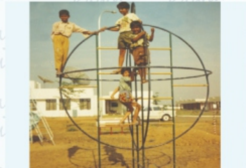
Moon Climber - RCL - 04