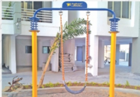
Spring Swing - RSW - 13