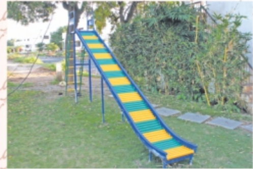
Roller Slide Ht. 7'-0" - RSL - 13