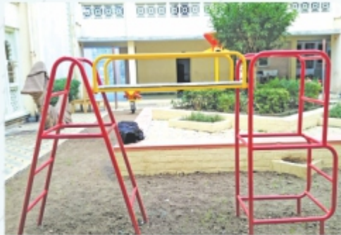
A to B Climber - RCL - 08