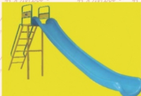
Straight Curve Slide - RSL - 21