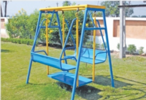
Self Swing - RSW - 05