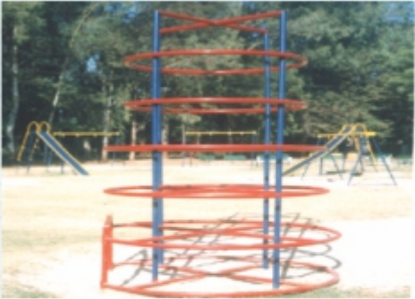
Round Climber - RCL - 18