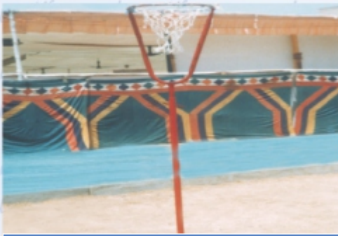
Basket Ball Ring - REX - 11