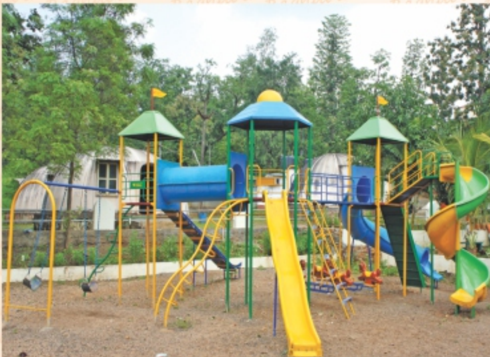
Three Deck Multiplay System - RMPS - 19