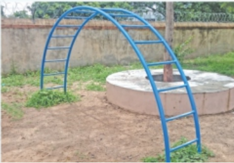
Rainbow Ladder - RCL - 01