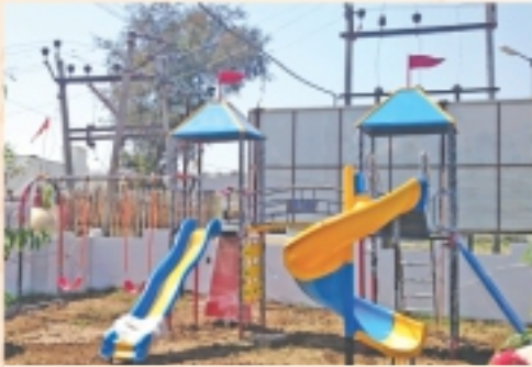
Two Deck Multiplay System - RMPS - 16