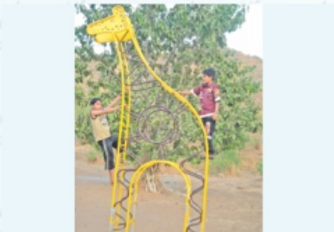
Giraffe Climber - RCL - 05