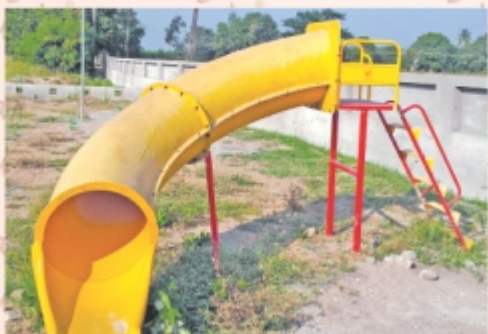
Mini Tube Slide Ht. 5'-0" RSL - 23