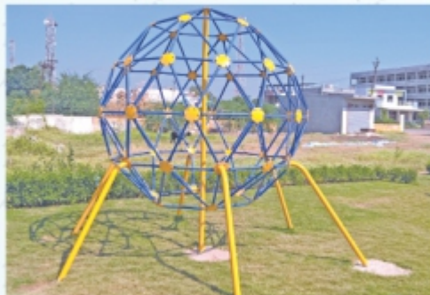
Crystal Maize Climber - RCL-16