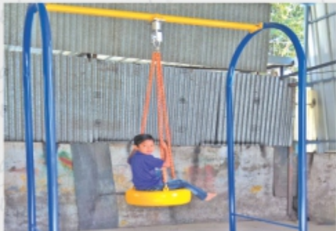
Arch Tyre Swing - RSW - 20