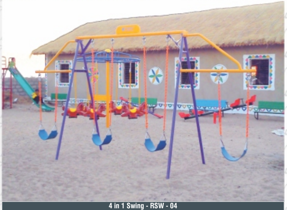
4 in 1 Swing - RSW - 04