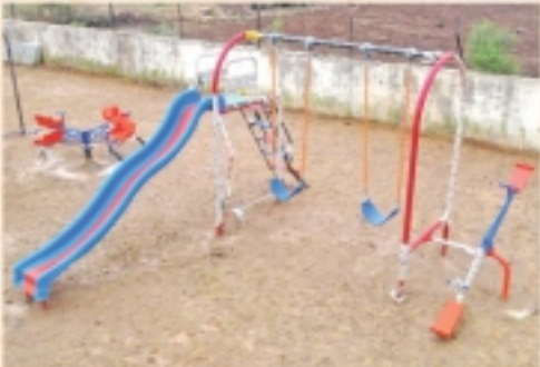
Combination Set 3 in 1 - RMPS - 07