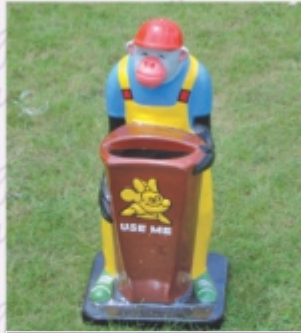
Monkey Dustbin - RGR - 04