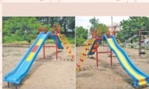
Combo FRP Roller and Wave Ht. 5'-0" - RSL - 24