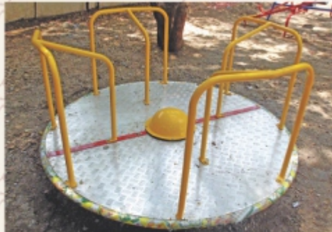
Revolving Platform - RMG - 01