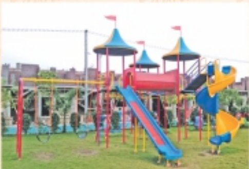
Three Deck Multiplay System - RMPS - 10