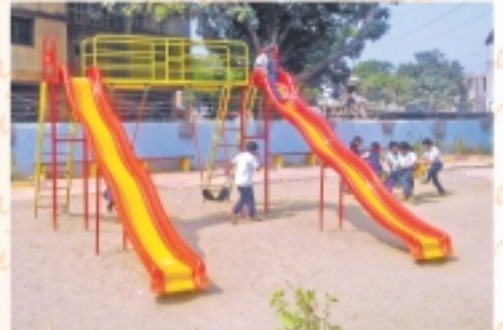
Double Wave Multiplay System - RMPS - 12