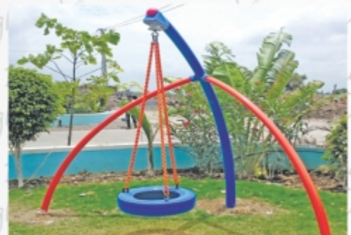
Tyre Swing 360° Rotate - RSW - 22