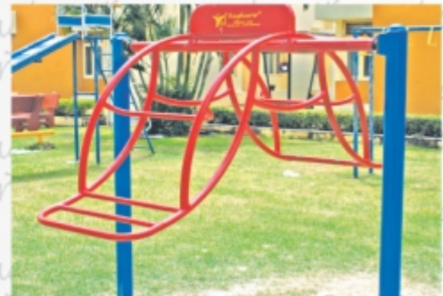
Butterfly Swing - RSW - 14