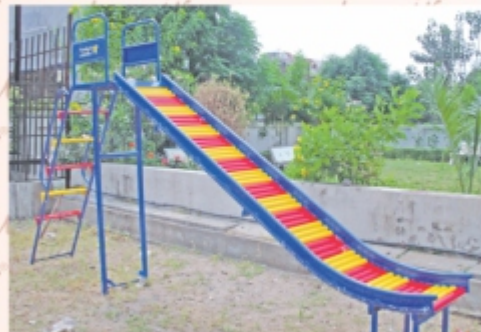
Roller Slide Ht. 5'-0" - RSL-12