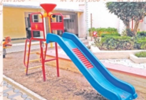
FRP Roller Slide Ht. 3'-0" - RSL - 22