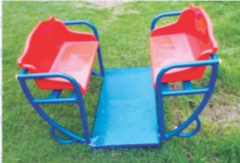
Rocking Boat 4 Seat - REX - 16