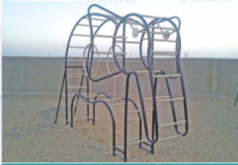
Elephant Climber - RCL - 23