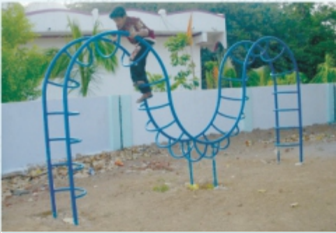
Humpty Dumpty Climber - RCL - 21