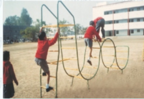
Sea Monster Climber - RCL - 14