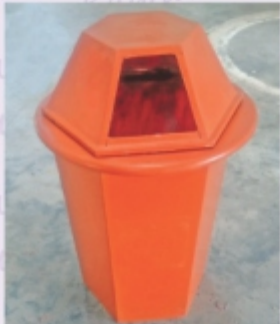
FRP Hex Dustbin - RGR-09