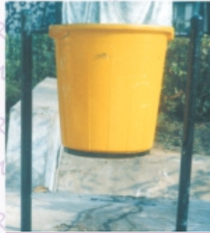
Tilttable Dustbin - RGR - 04