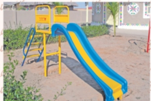
Wave Slide Ht. 3'-0" - RSL - 06