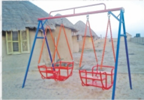
Kids Swing with Two Rocking Boat - RSW - 09