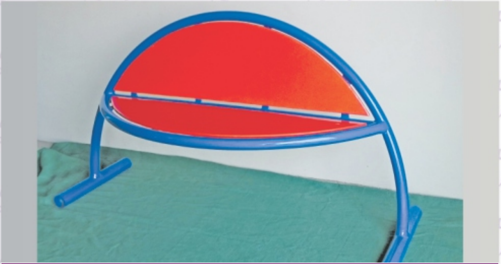
Arch Garden Bench - RGR - 10