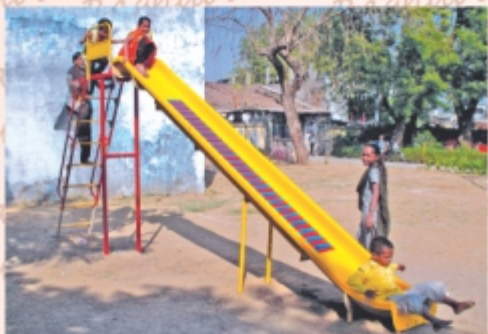
FRP Roller Slide Ht. 7'-0" - RSL - 18