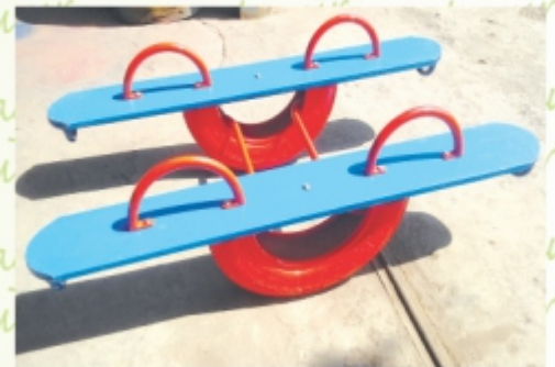
Smiling Seesaw - RSS - 06