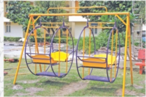
Double Circular Swing - RSW - 10