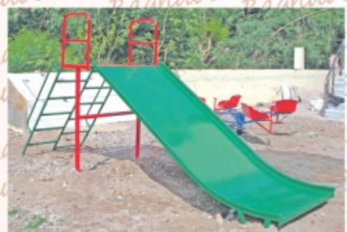
Wide Slide (G.I. Sheet) - RSL - 04