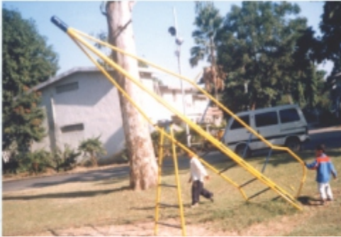
Rocket Climber - RCL - 19