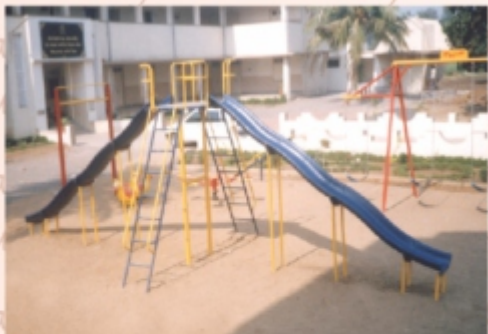
Double Slide (FRP) - RSL - 14