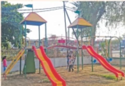
Two Deck Multiplay System - RMPS - 14