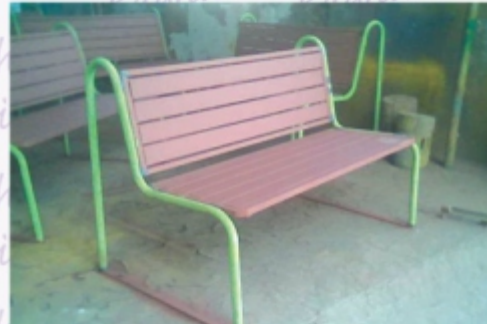
GI Pipe Frame Bench MS Strip - RGR - 05