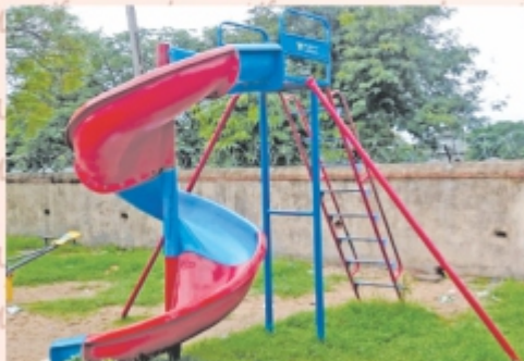
Spiral Slide Ht. 8'-0" - RSL - 10 & 10A