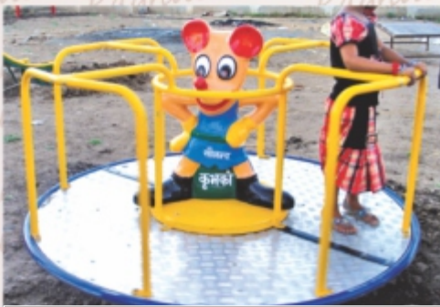
Revolving Platform Mickey - RMG - 06