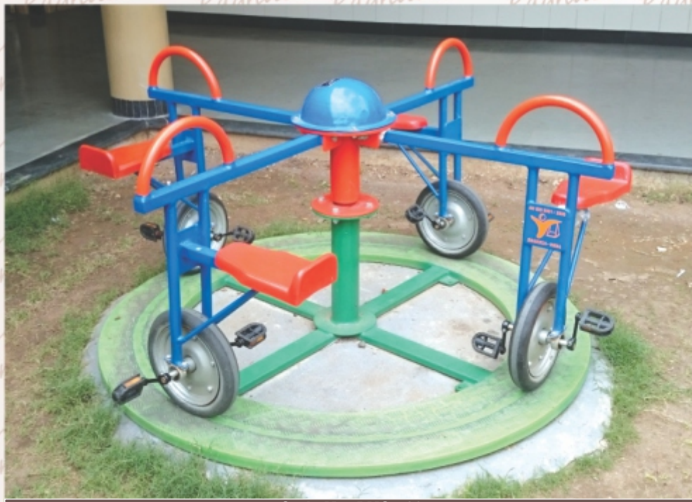
Cycle Mgr RMG - 08