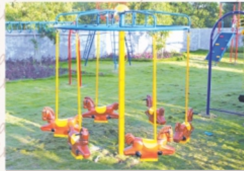
Horse Shape Mgr - RMG - 05