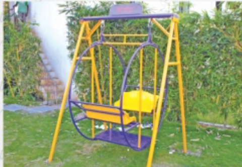
Circular Swing Single - RSW - 06