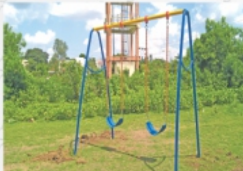
Double Swing - RSW - 02