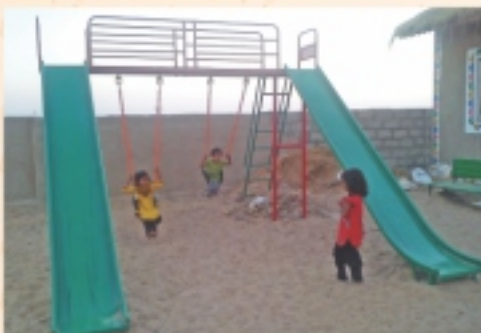
Double Slide Multiplay - RMPS - 04