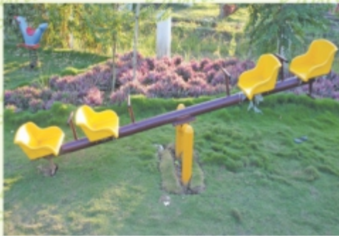
Multiseater Seesaw - RSS - 03