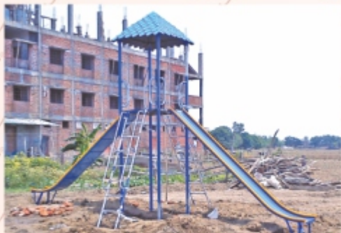
Double Slide (G.I. Sheet) with Canopy - RSL - 15