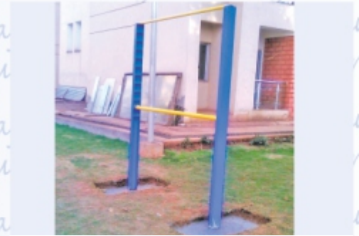
Pull Up Bar - REX - 02