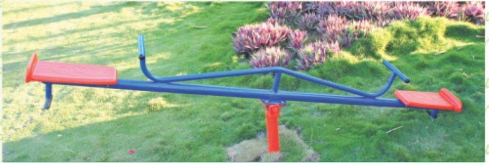
Single Seesaw - RSS - 01