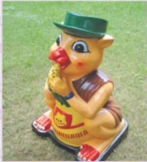
Joker Dustbin - RGR - 04