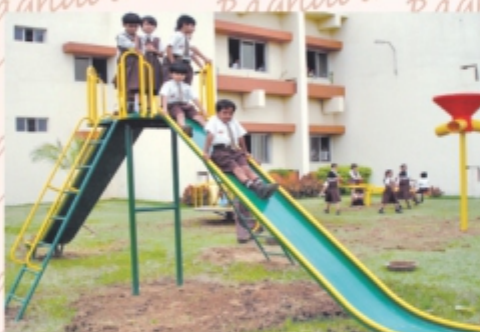
Double Slide (G.I. Sheet) Ht. 7'-0 - RSL - 03