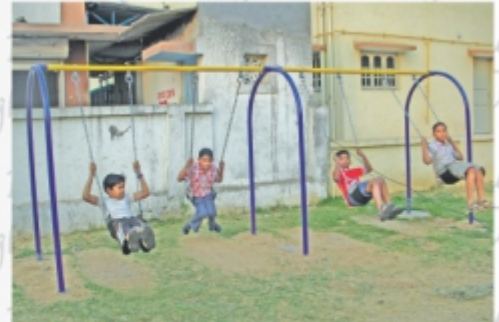
Arch Swing (4 Seat) Ht. 6'-0" - RSW - 18