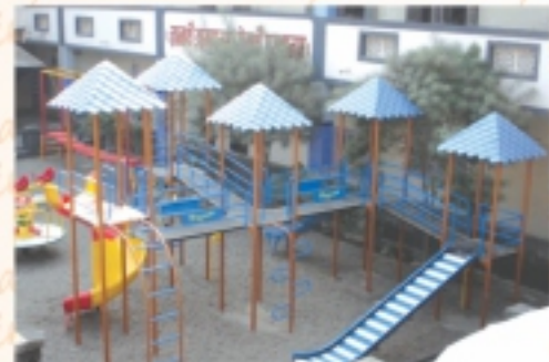
Five Deck Multiplay System - RMPS - 02