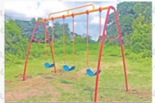
Tripple Swing - RSW-03