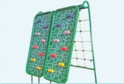
Adventure Climber - RCL-24