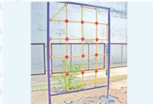
Straight Net Climber - RCL - 06