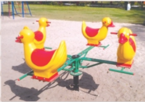
Animal Mgr - RMG - 03