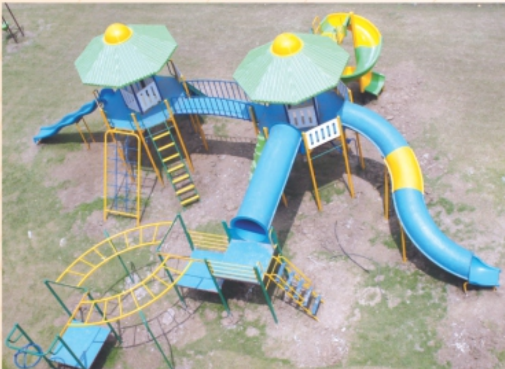
Octagonal Deck Multiplay System - RMPS - 01