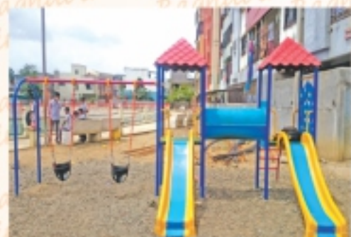
Two Deck Baby Multiplay System - RMPS - 20