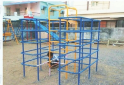
Square Climber - RCL - 17