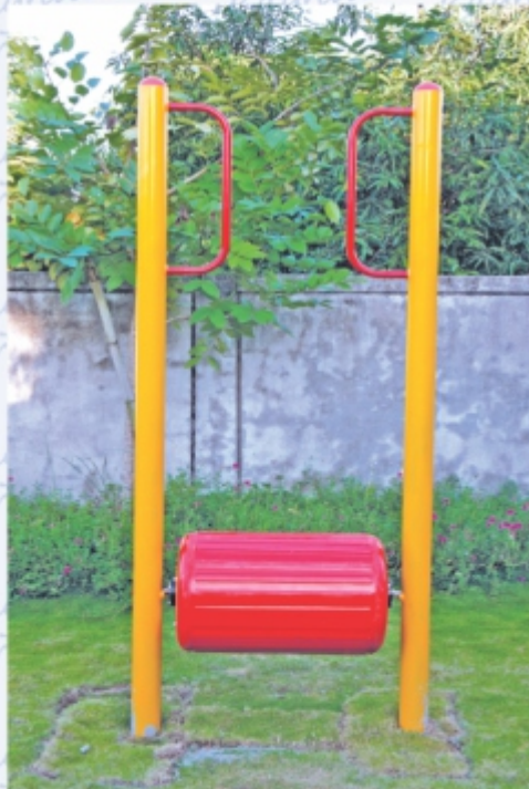
Walking Barrel - REX - 03