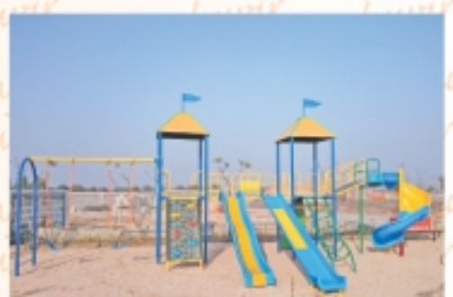
Two Deck Multiplay System - RMPS - 15