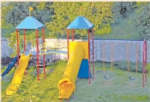
Two Deck Multiplay System - RMPS - 13