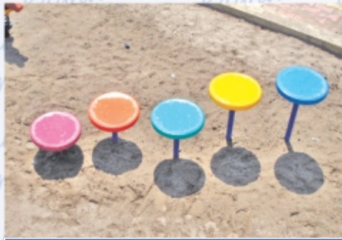
Hopping Pad - REX - 08