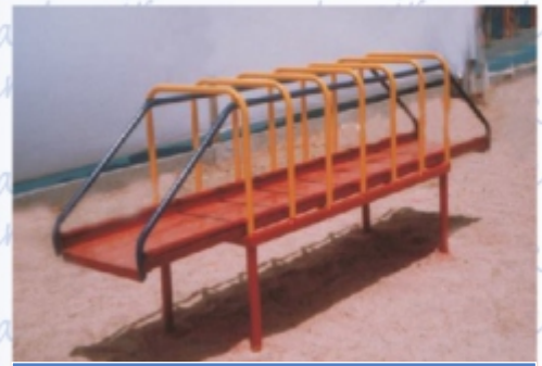
Crawling Maize - REX - 13