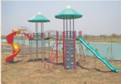
Octagonal Deck Multiplay Station - RMPS - 08