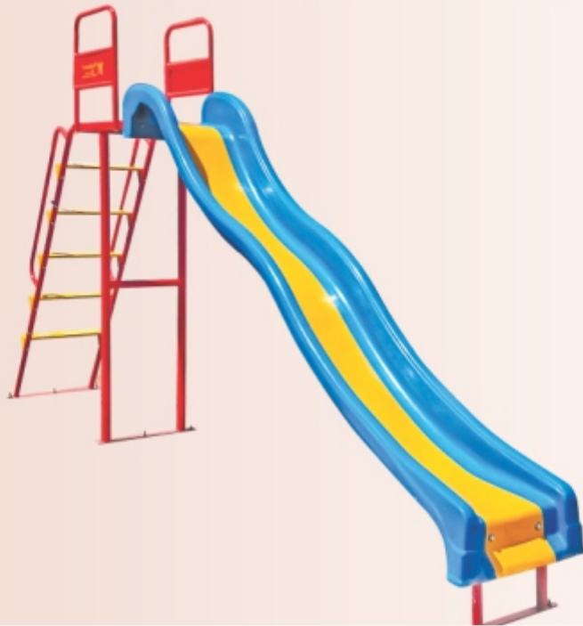
Wave Slide Ht. 5'-0" - RSL - 07