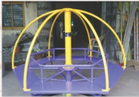
Ocean Wave Mgr - RMG - 04