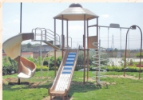
Hexagonal Multiplay System - RMPS - 05