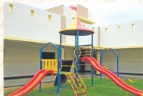
Two Level Multiplay System - RMPS - 21