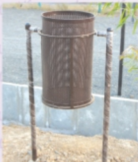
Allu. Tilttable Dustbin - RGR - 08