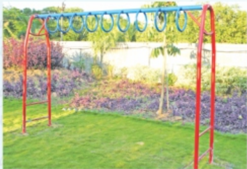
Loop Rung Ladder - RCL - 07