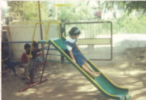
Plain Slide Baby (G.I. Sheet) - RSL - 01