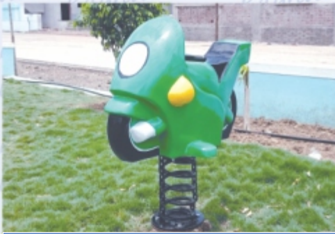
Spring Rider - REX - 07