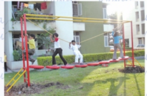
Balancing Bridge - REX - 05