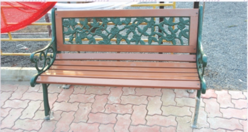
Cast Iron Garden Bench - Wooden Plank - RGR - 07