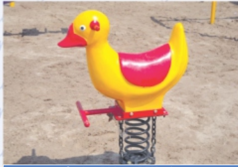
Spring Rider - REX - 07