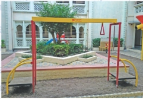
Zip Liner - REX - 19