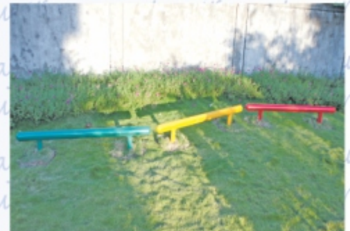
Balancing Beam - REX - 06