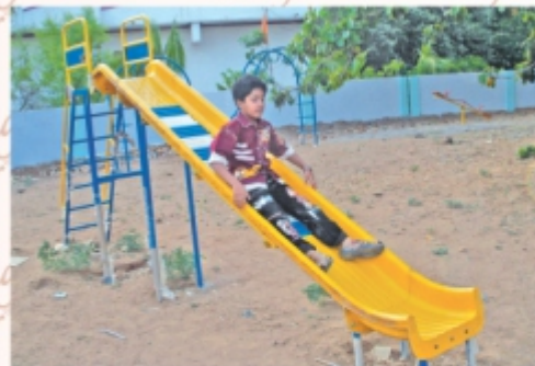
FRP Roller Slide Ht. 5'-0" - RSL - 17