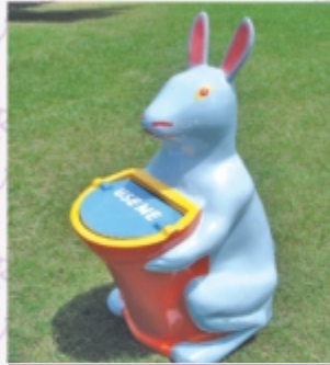
Rabbit Dustbin - RGR - 04