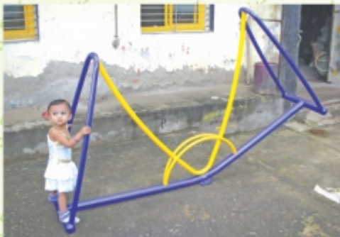
Standing See Saw - RSS - 05