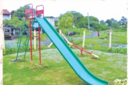
Plain Slide (G.I. Sheet) Ht. 7'-0" - RSL - 02