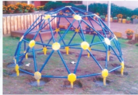
Sunset Climber - RCL - 09