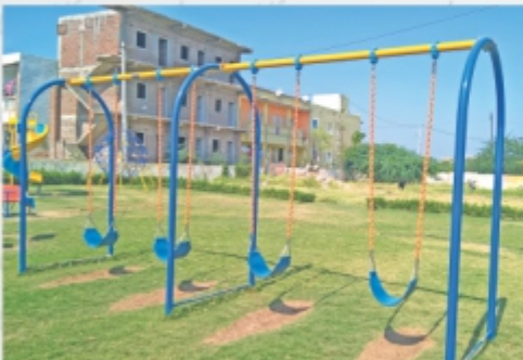
Arch Swing (4 Seat) - RSW - 12