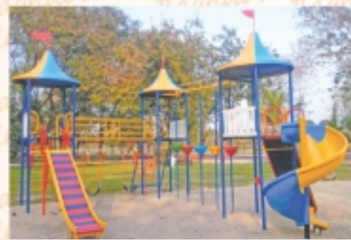
Three Deck Multiplay System - RMPS - 03