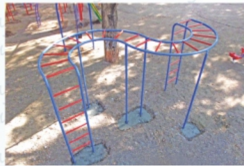
'S' Bridge Ladder - RCL - 02