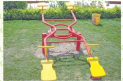
4 Seater Seesaw - RSS - 04