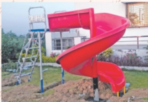
Spiral Slide Ht. 5'-0" - RSL - 05