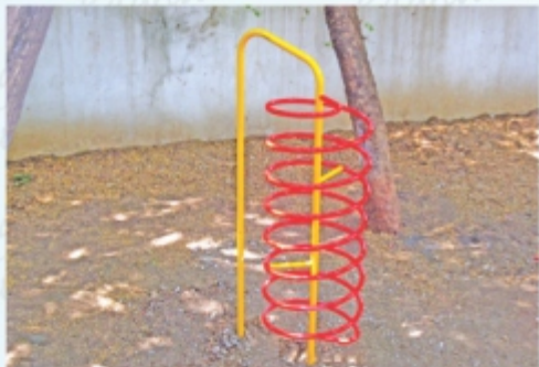
Spiral Climber - RCL - 10,11,12