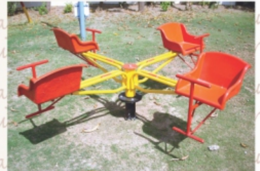
4 Seater Mgr - RMG - 02