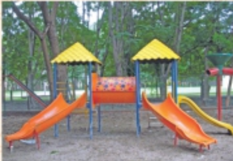
Two Deck Baby Multiplay System - RMPS - 11